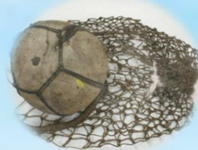
<Tewak Mangsari(catch net)>