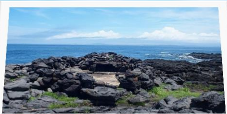
<Marado Island Aegieopgaedang>