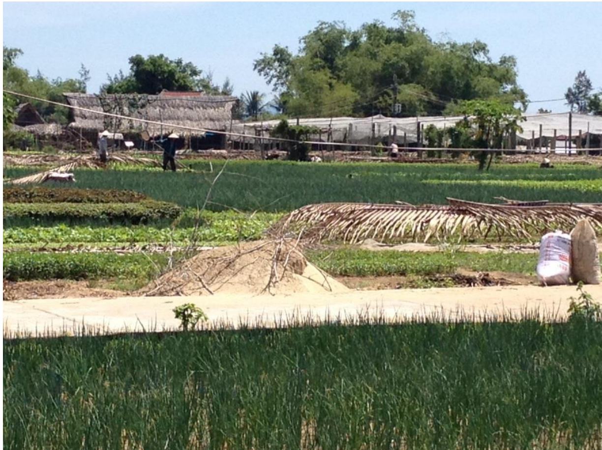
The Tra Que organic farming village in Hoi An city